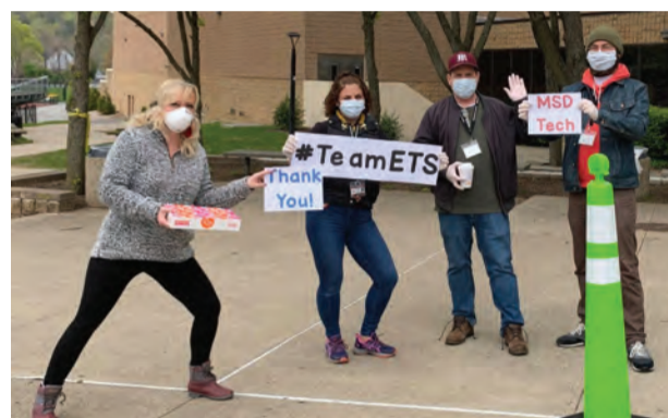
MSD Tech Staff