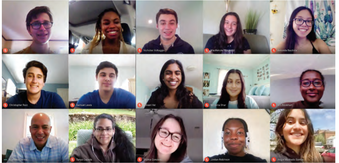
The Equity and Inclusion Student Council Executive Board, 2020-21