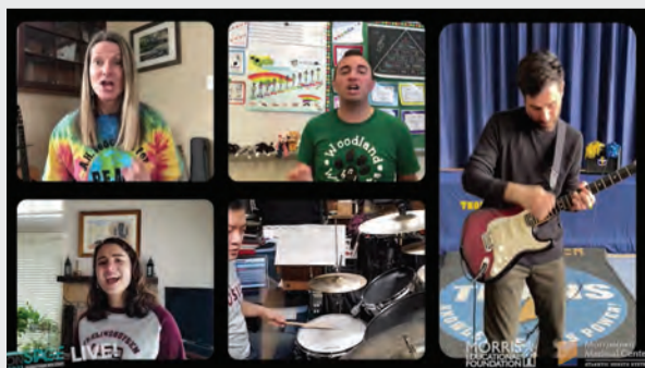
Panic! at the Mayo: $500 "Audience Choice" text-to-vote winner comprised of 12 District music teachers.