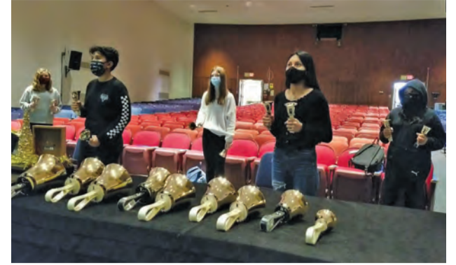
FMS choral students rehearsing for their Virtual Winter Concert using handbells received from a $15,250 grant from the MEF to allow for in-person collaborative music making! 250 students expanded their musical aptitude and students will continue to do so through this lasting program at Frelinghuysen.

Finally, in May, Morristown High School welcomed audiences to the Spring Concert—the District's first in-person concert since December 2019. Families brought blankets and lawn chairs to the