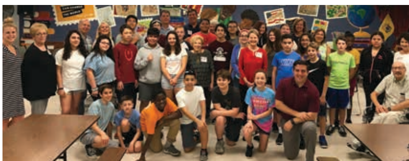
Community volunteers work with FMS staff to tutor students in language arts and math. Every spring, they celebrate together with a breakfast. If you are interested in volunteering, please contact info@morrisedfoundation.org .