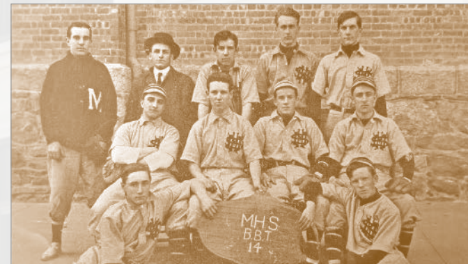
MHS Baseball Team, 1914

A tradition of excellence in athletics continues today. The 2017-18 MHS Varsity Baseball team took home the Morris County Championship.