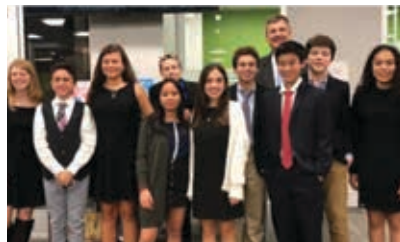
The FMS Debate Team competed in a high school-style speech and debate tournament at Montville Township HS on November 2. Each of the four FMS pairs of debaters won at least one debate.