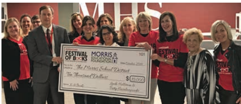
The MEF was the proud non-profit partner of the Morristown Festival of Books again this year. Through this joint commitment to literacy, $10,000 was presented to the Morris School District for the purchase of books on social-emotional learning.