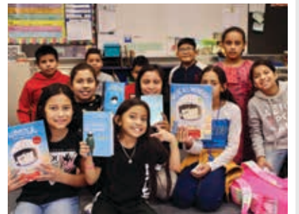
Normandy Park students know it's "Cool to Be Kind" thanks to the MEF Gratitude Grant-funded yearlong theme. All students will read Wonder this year, including all English language learners.