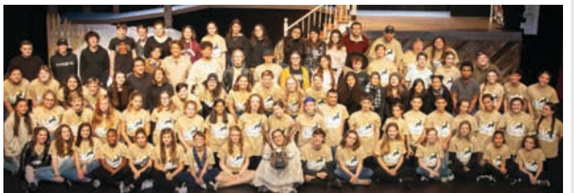
MHS presented the high school world premiere of Prancer , based on the 1989 holiday film. The cast and crew worked tirelessly to bring this magical production to life.