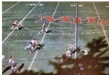
All athletic events held on Memorial Field and the Main Gym are now available for online viewing thanks to the Pixelott camera system and a grant from the NFL. Viewers can watch the Morristown Field Hockey State Sectional Champs, pictured above, in their big win over Montclair.