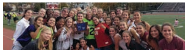
Field Hockey Sectional Champions 2018

Girls Cross Country: 7th place in sectionals at Garrett Mountain.