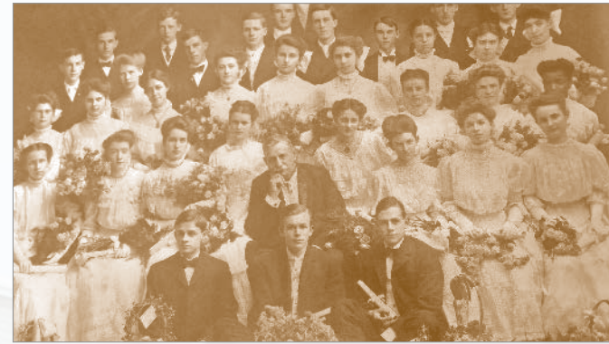
MHS Graduating Class of 1909