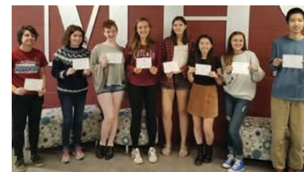
National Merit Commended Scholars, Class of 2019