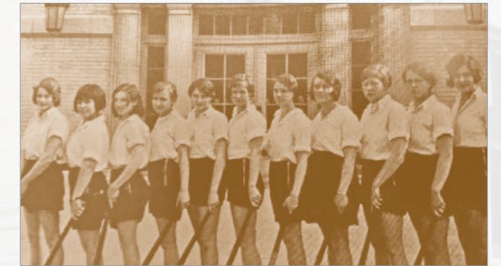
MHS Field Hockey Team, 1930

Girls' sports came to MHS in the 1920s and is still thriving. The 2018 Varsity Field Hockey team won the State Sectional Championship in a gripping overtime game.