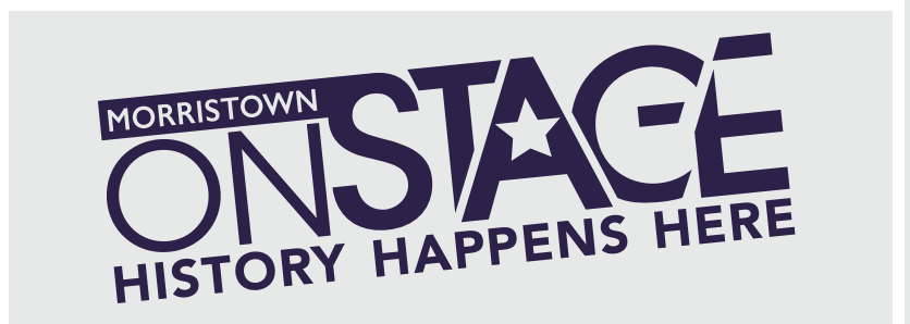
Morristown Onstage, the MEF's premier fundraising talent show, will be on Wednesday, February 27, 2019, at the Mayo Performing Arts Center. The area's best amateur talent will compete for a chance to win one of three prizes: $1000 for 19 & older, $1000 for 18 & younger, $500 for viewers' choice. Don't miss your chance to support your schools while having a great time! Tickets go on sale in early February 2019.