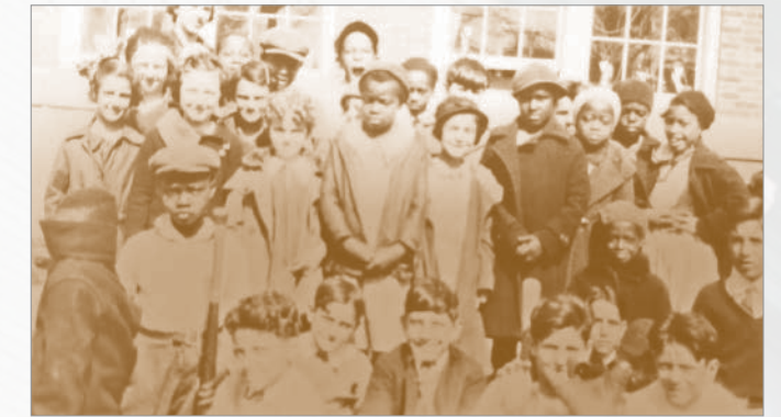
MSD 3rd Grade Students, 1935

The Morris School District has long been a model for successful integration. Our schools have always reflected the vibrancy of a diverse community—an ongoing source of pride for the district and the towns it serves.